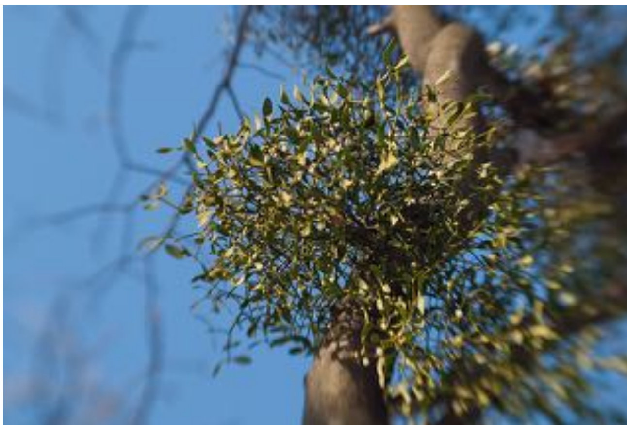
Mistle Toe – one of my plant guides – another powerful healer with a long tradition within human culture

Please feel free to share this widely so that many can benefit – as nature shares her gifts.